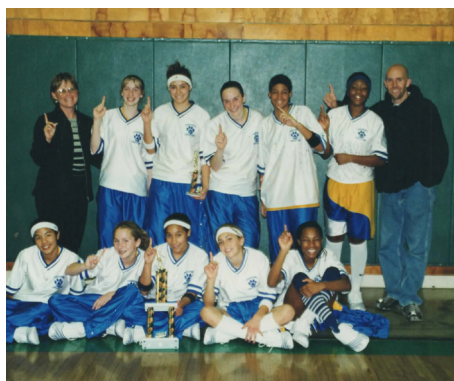
2003 - First Basketball Championship